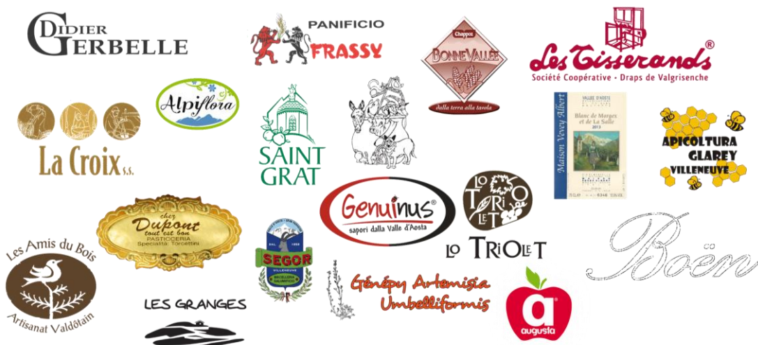
Figure 3: the local producers

The most important role in this project is covered by the local producers. The network created by Tascapan focuses indeed on small companies, often family-run, that work with traditional methods and whose products cannot be found in large distribution. Thus, the platform offers an opportunity to bring together in a single virtual place the products and the stories of the people of Aosta Valley. The project started its activities with six producers, who have tripled in just one year: 120 labels and 19 manufacturers are online today (Figure 3). Some smaller manufacturers have experienced a sudden rise of requests, which has generated a significant increase in their production.