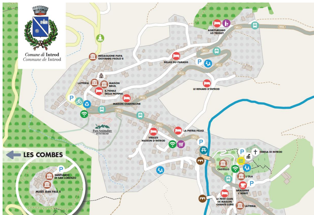
Figure 4: the developing tourism scenario of Introd

The museum was in fact conceived as a physical support that favours the territorial enhancement of Introd and its surrounding areas also in terms of tourism. The innovative food project Tascapan has produced positive impacts on local tourism development, becoming a reference point for the initiatives and the tourist proposals that, until today, were carried out in an independent and fragmented way by various local actors. Tascapan relies on the collaboration among a multiplicity of public and private stakeholders. Hence, it has been able to create a network on the territory that turned the village of Introd into an emergent tourist destination (Figure 4).